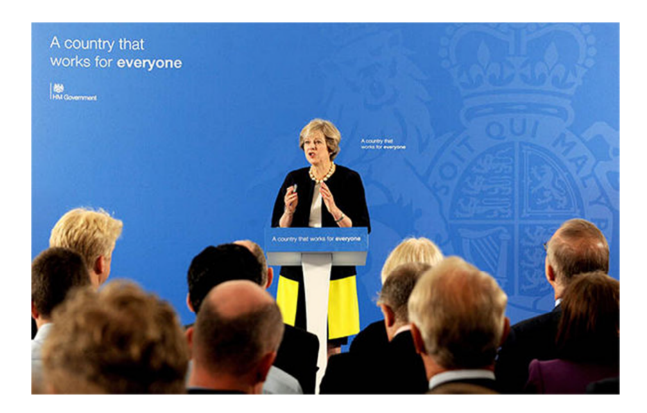
Theresa May has pledged to create a fair school system that doesn't disadvantage poorer children

The report adds: "No long-term policy of getting more such children into grammar schools can be fulfilled unless the Government addresses and resolves these inherent prejudices in primary school education."