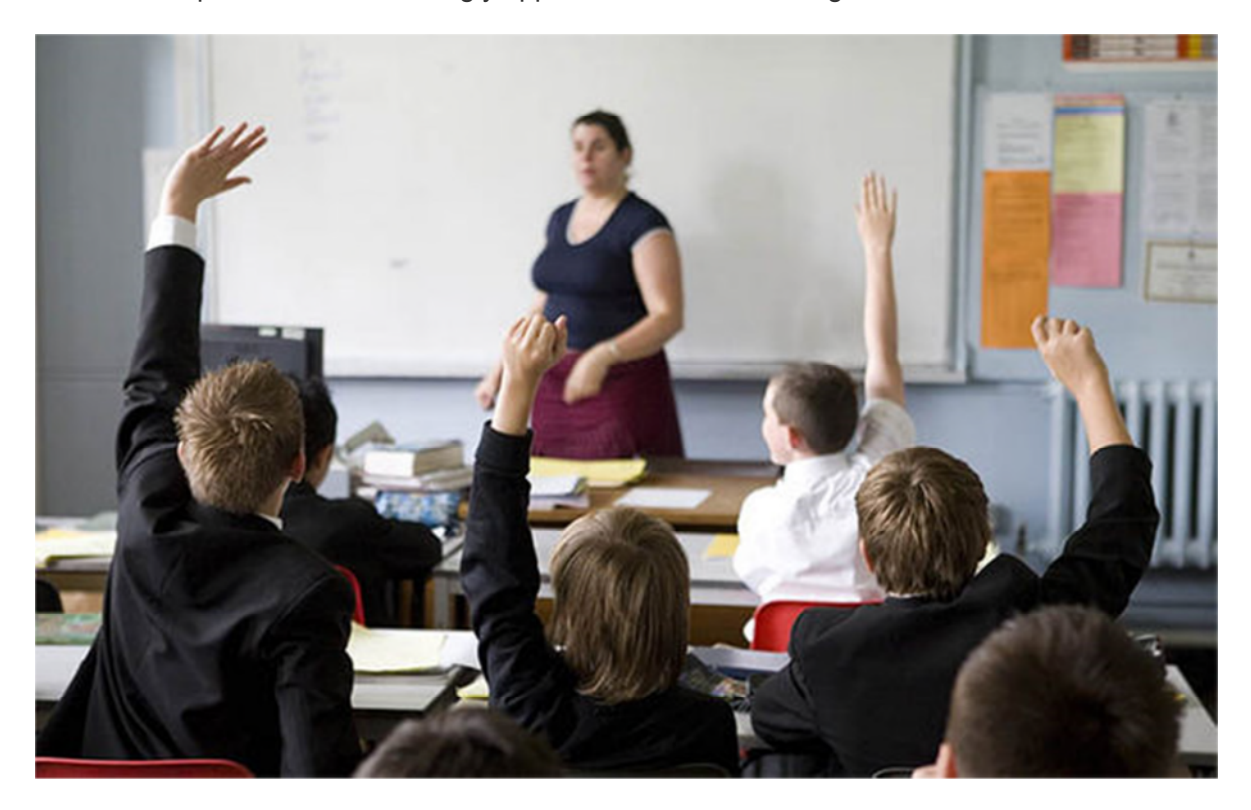
The NGSA believes that more rounded teaching at primary school will create a level playing field

The NGSA report also says that for decades many teacher training colleges and university education departments have strongly opposed selection teaching.